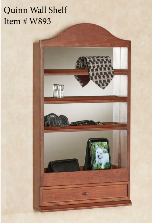
Quinn Wall Shelf Item # W893

How to hang using the French cleat mounting system.