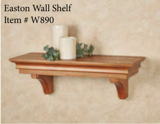
Easton Wall Shelf Item # W890

How to hang using the French cleat mounting system.