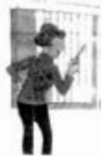
Keep all window pull cords and inner lift cords out of the reach of children. Make sure that loosened pull cords are short and continuous-loop cords are permanently anchored to the floor or wall. Make sure cord stops are properly installed and adjusted to limit movement of inner lift cords.