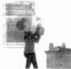
Lock cords into position whenever horizontal blinds or shades are lowered, including when they come to rest on a windowsill.