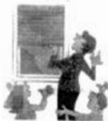
Install cordless window coverings in children's bedrooms and play areas. Replace window blinds, corded shades and draperies manufactured before 2001 with today's safer products.

And remember to always follow these basic window-cord safety rules: