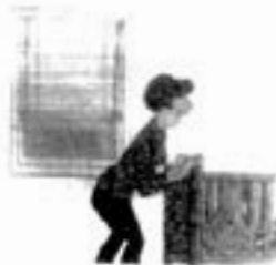
Move all cribs, beds, furniture and toys away from windows and window cords, preferably in another wall.